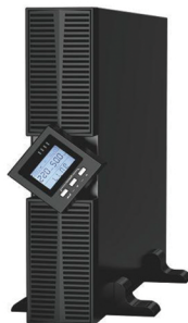
Display panel can be rotated